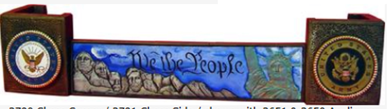
2790 Chess Corner / 2791 Chess Side / shown with 2651 & 2650 Appliques