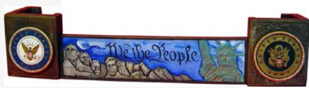
2790 Chess Corner / 2791 Chess Side / shown with 2651 & 2650 Appliques