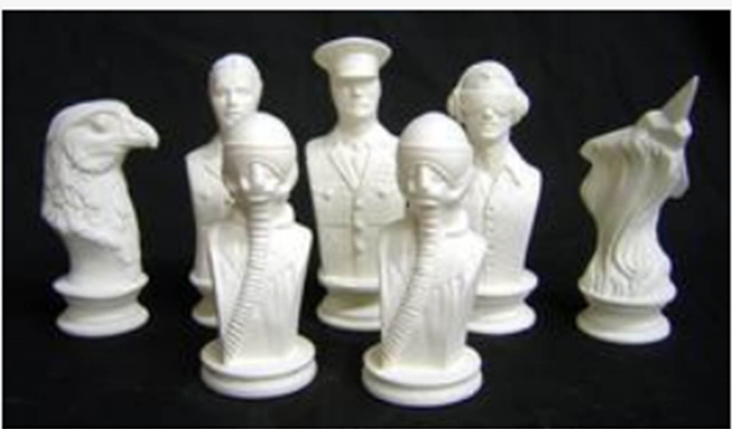
Air Force Chess Set 2897-King and Queen 2898-Knight Rook 2899 Pawns