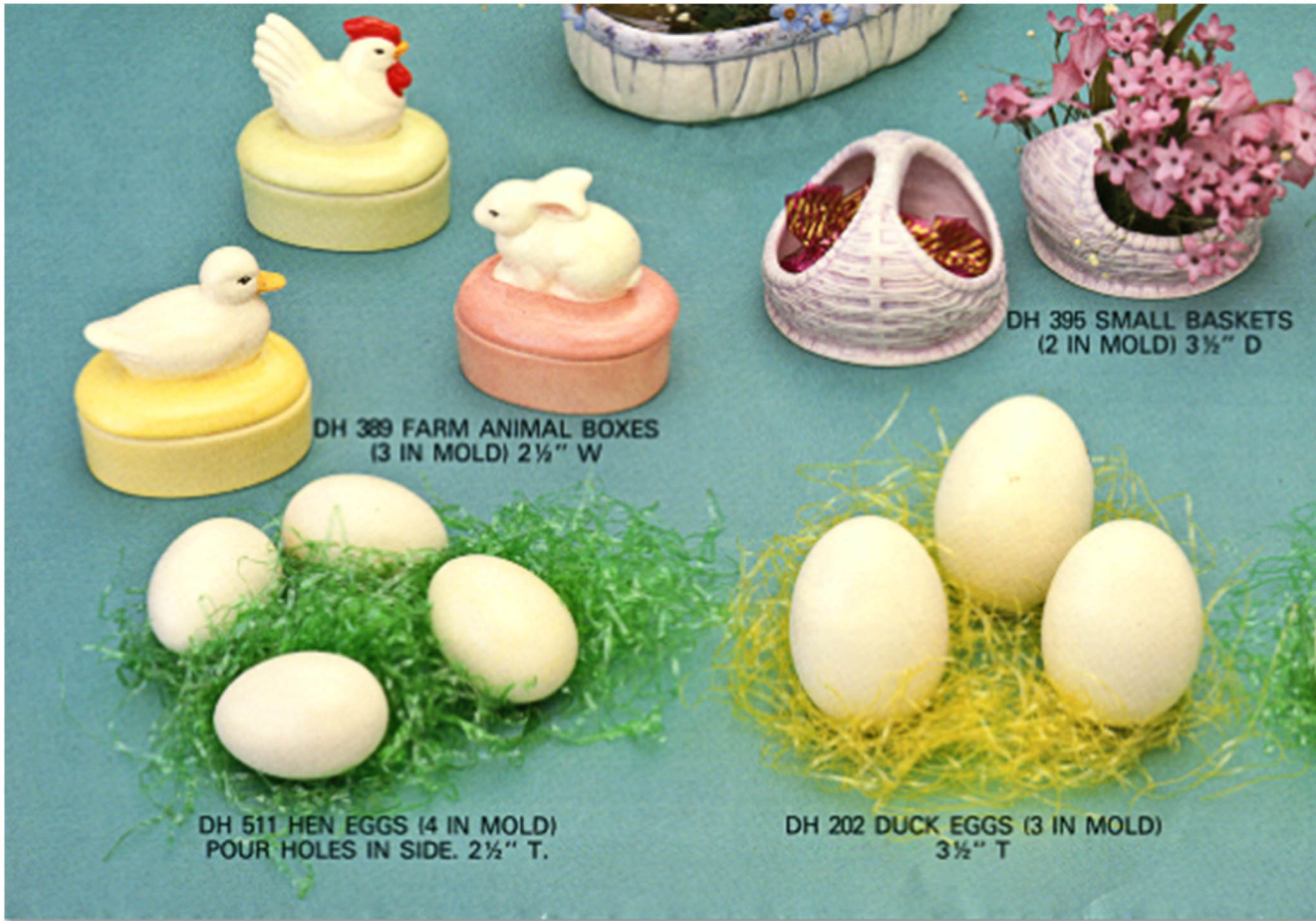
DH 389 FARM ANIMAL BOXES (3 IN MOLD) 2 1/2" W