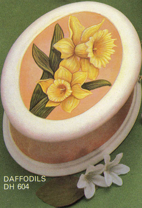
DAFFODILS DH 604